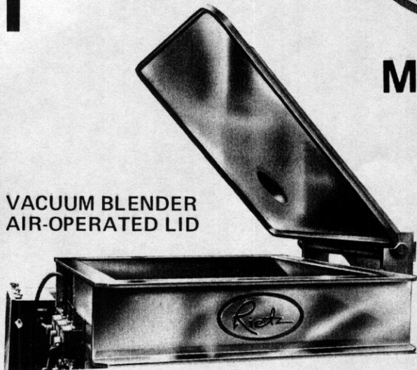
VACUUM BLENDER AIR-OPERATED LID