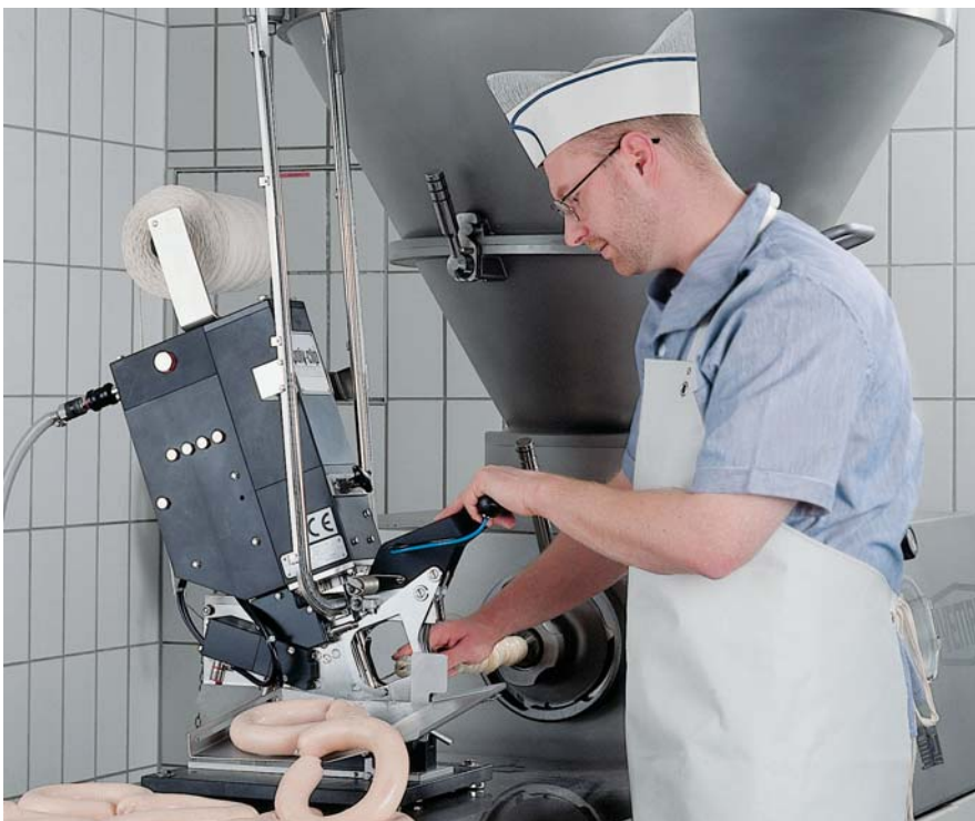
PDC 600 with string dispenser placed in front of the filler. Up to 40 kg of sausage in 5 minutes can be produced easily.