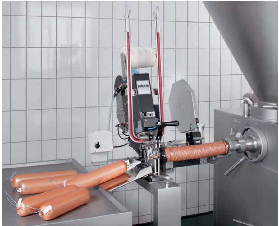
The PDC 700 closes all diameters up to 115 mm.