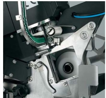
The separator is adjustable and can be adapted to any product. This ensures an attractive product appearance.