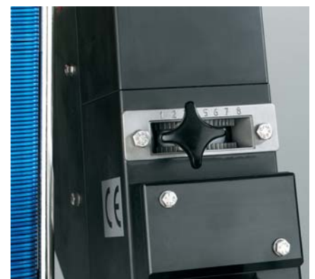
The clip pressure can be adjusted perfectly.