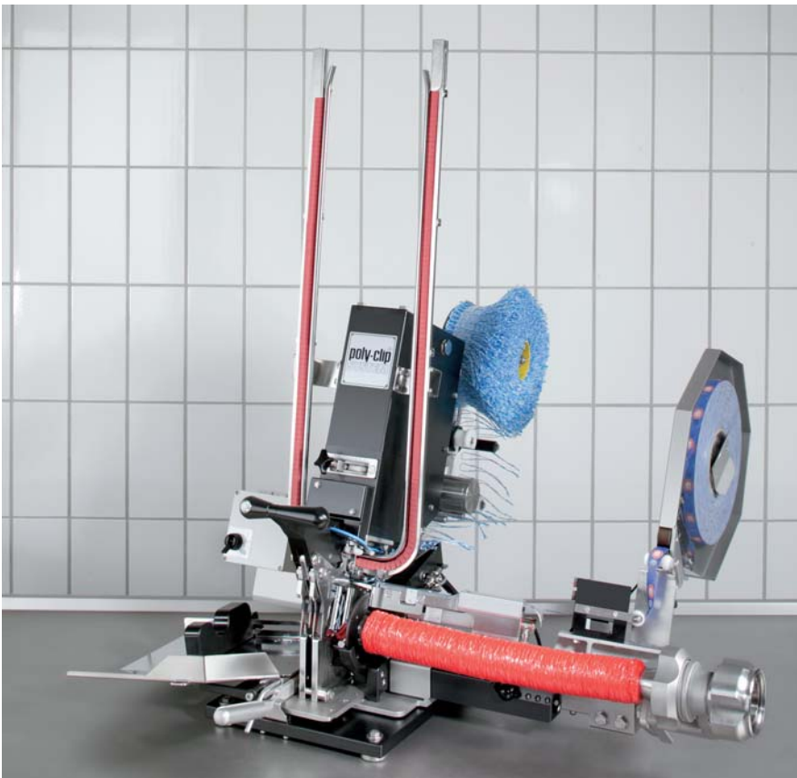
Loops may either be inserted manually or fed and clipped automatically.

tapeless loops can be inserted and clipped, either manually or automatically.