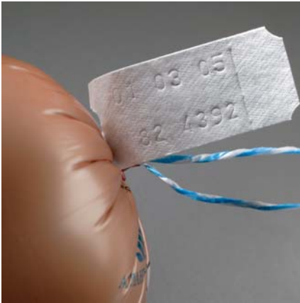
Simple and safe: marking by embossed labels