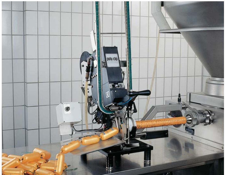
Products with diameters up to 80 mm in diameter can be produced quickly and safely with the PDC 600.