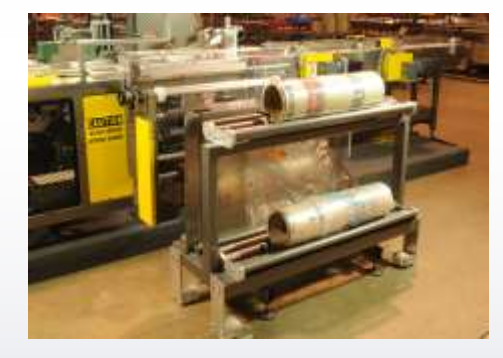
Film holder with two positions