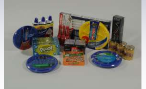
We can run different shapes, sizes and dimensions on APM shrink wrapping systems

AMERICAN PACKAGING MACHINERY, INC. 2550 S. EASTWOOD DRIVE WOODSTOCK, IL 60098 Phone: 815 337-8580 Fax: 815 337-8583 www.americanpackagingmachinery.com sales@americanpackagingmachinery.com