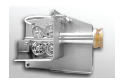
Parts are electro-polished for improved cleaning possibilities.