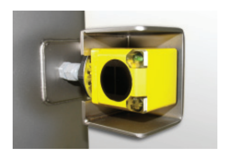
Lower noise levels: infeed sensor shuts off air supply when no product is fed into the peeler.