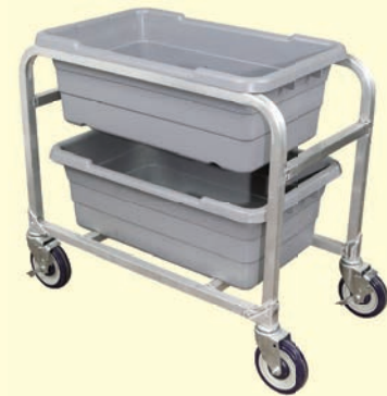
Standard Lug Cart Supplied - Less Lugs