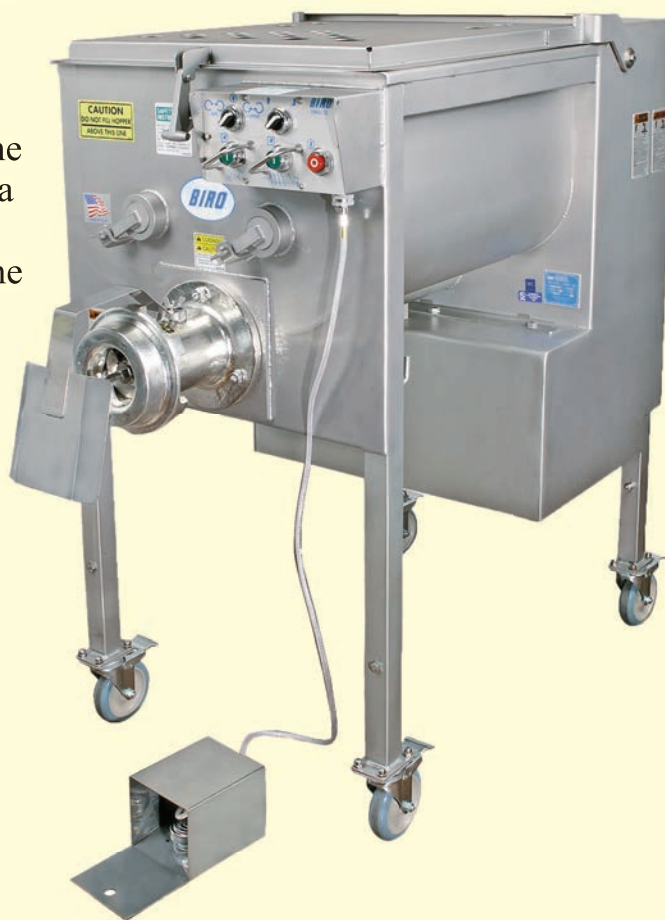
Shown with Standard Pneumatic Footswitch

Increase your meat grinding operations to new heights of productivity, efficiency, and profit with the BIRO EMG-32 Ergonomic Mixer Grinder. The top of the hopper is low so that the average operator no longer has to lift a full meat lug above their shoulders to dump it in the hopper. Additionally, the grinding head is higher so you don't have to bend over to fill trays prior to packaging. Just as important, you get all of this without sacrificing the quality of your end product. Typical temperature rise of the product is 0° to 3°F (depending on product and ambient temperatures) which help ensure maximum shelf life. The twin mixing paddles feed the auger of the EMG-32 evenly and smoothly giving you a fast, thorough blend without overworking your product. The compact size means it fits nicely in today's smaller, more efficient meat rooms, so that you can continue to maintain a high level of productivity in minimal space. All of this comes with the superior BIRO design and reliability you've come to expect.