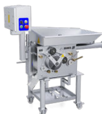
Top Feed Tray/ Pipe Feed/ Sensor