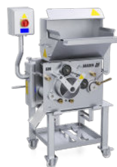
Tiltable Product Tray/Timer