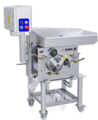
Top Feed Tray/Sensor