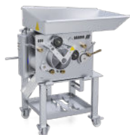
Top Feed Tray/ Pipe Feed