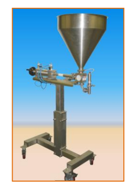
Adj. height s.s. floor stand