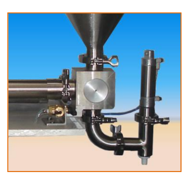
Positive cut-off filling nozzle