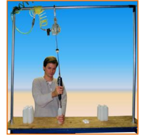
Hand cap tightener