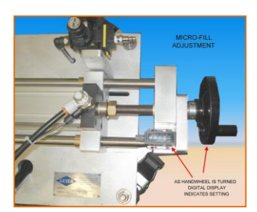
Micro fill adjustment