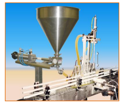
Diving nozzle attachment