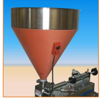
Silicone heater for hopper