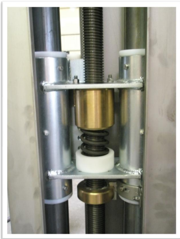
2" Diameter Heavy-Duty Screw with Safety Nut