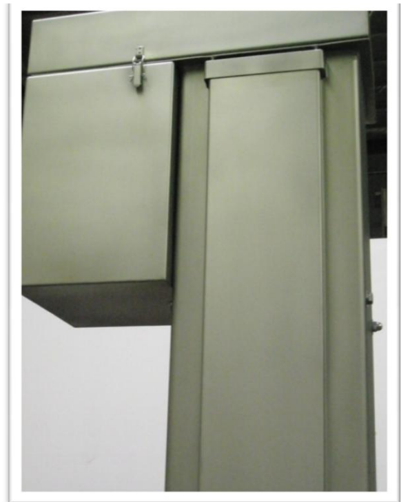
3/16" Thick Column Body – 304 Stainless Steel