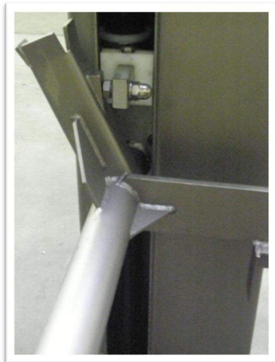
Stainless Steel carriage arm – connects to loader by sliding over hardened CRS machined shaft